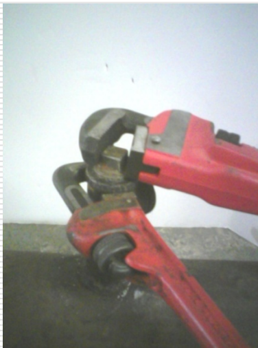
Plug tighter than tee

Cut branch close to the body of tee and re-build ball valve assembly on top of the tee using the base adapter.