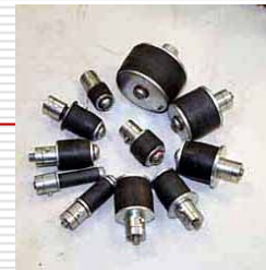
Rubber expansion stopper is inserted into throat of tee and plug is replace.