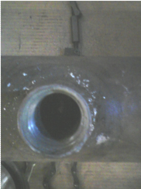
Coupling I.D and hole in the main are the same.

If the location of the main hole is either off-center or the same bore as the coupling I.D, then an alternative operation is used.