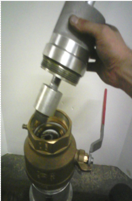
Plug insertion adapter

After tee removal, tighten plug into coupling using plug insertion adapter. Remove assembly and tighten plug with a pipe wrench to complete the operation.