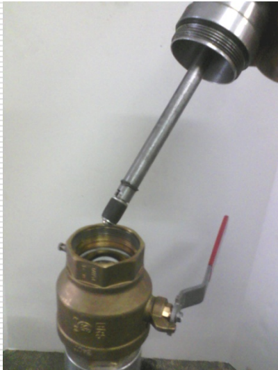
Expansion plug insertion tool

Remove Street-Tee plug and insert rubber expansion plug into the throat of the Street-Tee to stop the flow of gas.