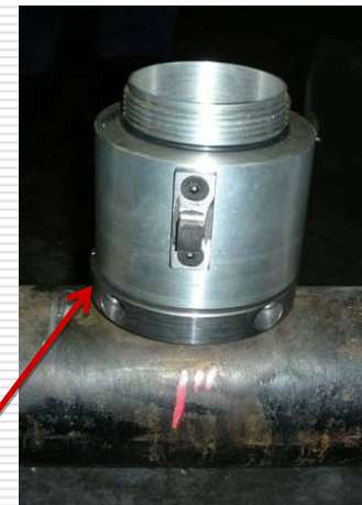
Base adapter: Half collars that seal around coupling.