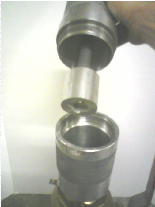
Plug removal adapter.