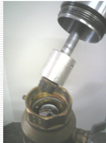
Plug removed. Held in place with magnet.