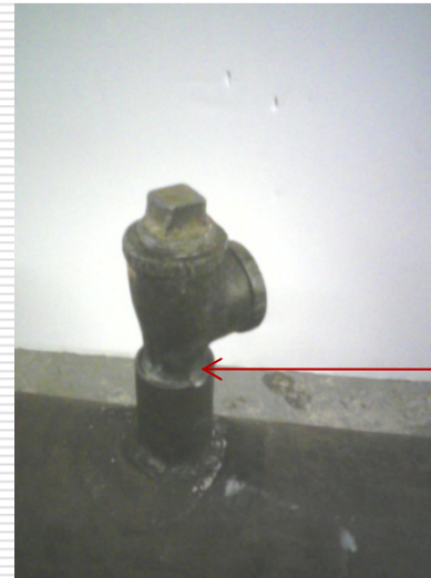
Assembly is removed.