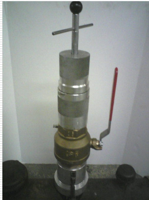
Plug removal adapter removes the tee Gas-Free.