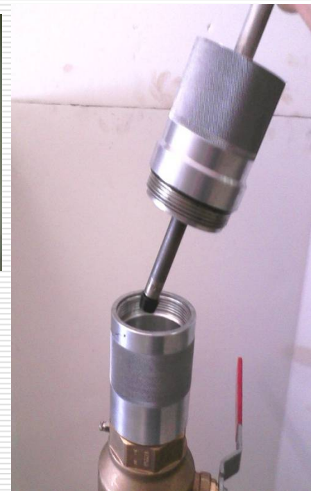
Self tapping plug insertion tool

PLCS Threadseal mastic is applied to self tapping plug for leak free seal.