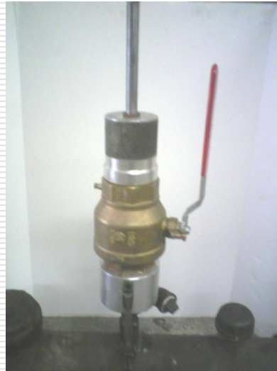
Expansion plug is secured into throat of tee.