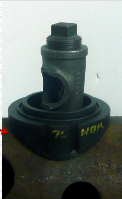
Rubber Saddle (original design)

When performing the tee removal process, the original assembly used a rubber saddle that was fitted on the main. Leaks occurred at the apex of the main between the main and saddle.