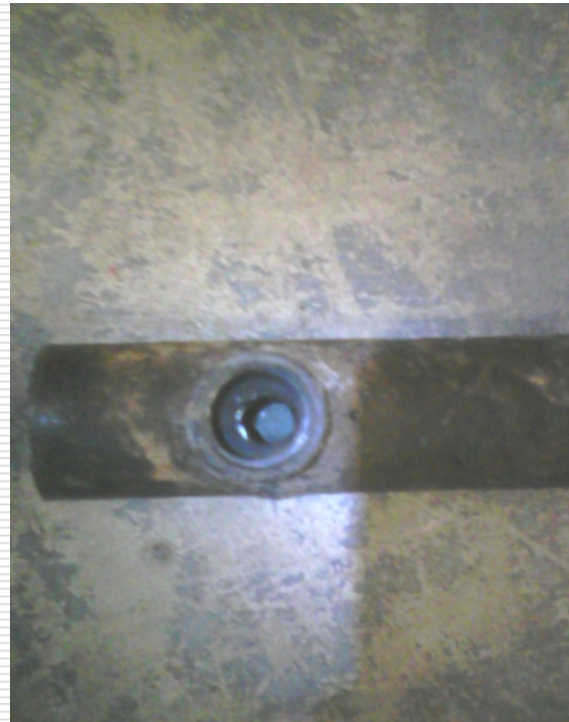
Hole is off-center