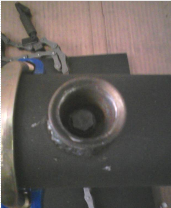
Self-tapping plug shown in main for illustration.

Once self tapping plug stops the flow of gas, purge remaining gas, cut branch, remove tee and complete operation by tightening malleable plug into coupling. Check for leaks.