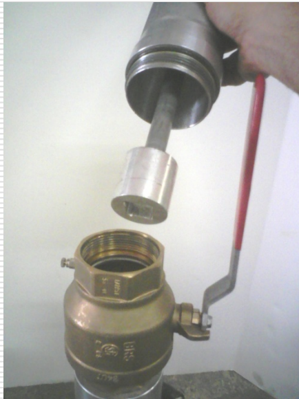
Plug adapter with integrated magnet.