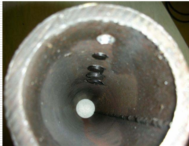
Self tapping plugs have a low profile in main.