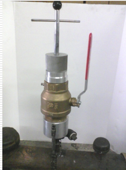
Using t-handle the plug adapter is lowered onto the square head of the plug, loosened, removed and retracted above the ball valve.