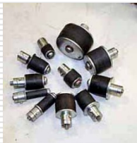
Expansion stoppers available sizes 1/2"-2"